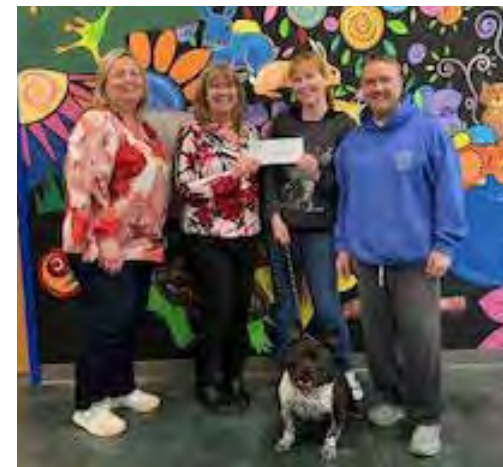
The Freedom to Help Foundation donates to Luna's House Animal Care and Education Center, supporting its mission to care for animals in need and connect them with loving homes.