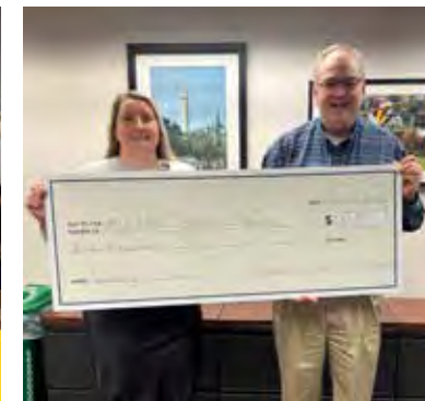
Through The Freedom to Help Foundation, Freedom presents a donation to MedStar Franklin Square Medical Center supporting its Employee Assistance Fund and Food Rx Program, helping strengthen community health and wellness.