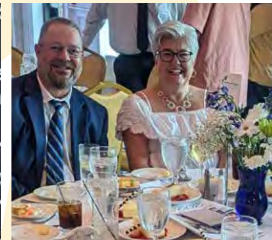
As a premier sponsor of the Harford County Public Schools Service Recognition Program, Freedom helps celebrate employees whose years of dedication make a lasting difference for students and families.