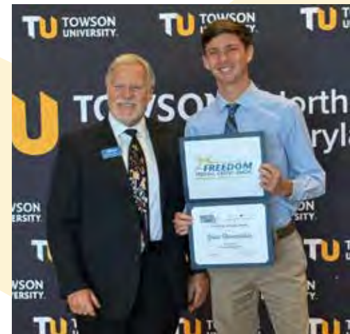
Freedom proudly sponsors a 2025 Harford County Chamber of Commerce STEM Scholarship, recognizing student achievement and investing in the next generation of innovators and leaders.