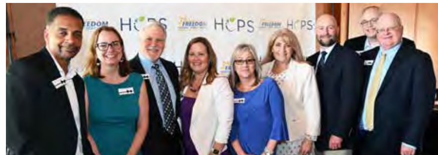
Through its sponsorship of the Harford County Public Schools Bus Driver and Attendant of the Year Banquet, Freedom helps to recognize transportation team members who safely support students each day.