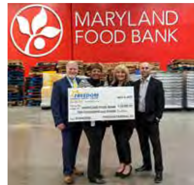
In response to urgent community need, The Freedom to Help Foundation provides a $10,000 donation to the Maryland Food Bank, helping supply more than 10,750 meals to nearly 700 households impacted by the SNAP benefit suspension.