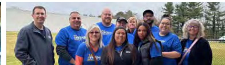
Freedom team members volunteer with Extreme Family Outreach to assemble and deliver Thanksgiving meals to local families, helping bring support and holiday cheer across the community.