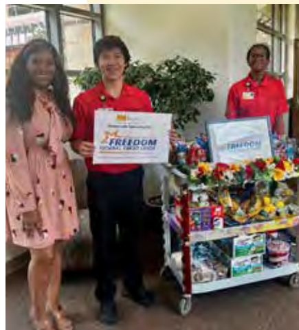
Freedom delivers snacks, supplies, and small comforts to brighten the day for healthcare staff as sponsor of the Upper Chesapeake Health's Cheer Cart program.