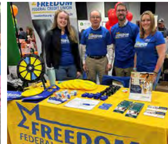
At the Harford County Housing Fair and Freedom's First-Time Homebuyer Workshop, Freedom's mortgage team shares guidance and resources to help families take confident steps toward homeownership.