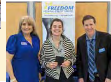
Freedom supports The League for People with Disabilities by promoting resources and services that empower individuals and families in the community.