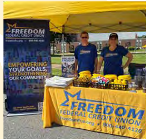
Freedom team members connect with the community at the 2025 Perry Hall Town Fair, sharing resources and celebrating local engagement and community.