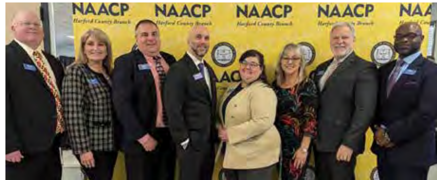
Freedom was a proud sponsor of the Harford County NAACP's Freedom Fund Luncheon, supporting an event centered on mentorship, legacy, and positive community impact.