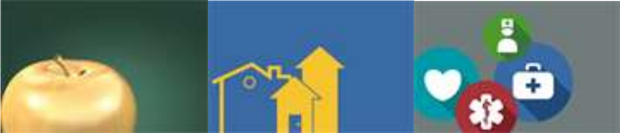
Golden Apple Program for Education Professionals