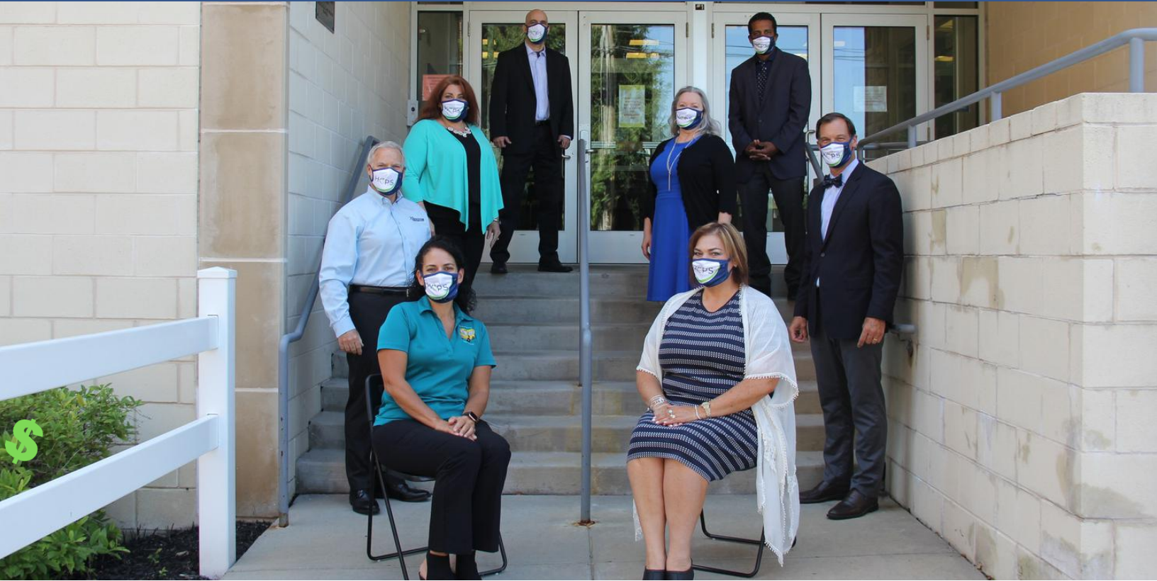
Harford County Public School (HCPS) and Freedom Federal Credit Union leadership and staff representatives gather on the steps of HCPS Headquarters to showcase the new masks that will be distributed to HCPS employees across the school system.