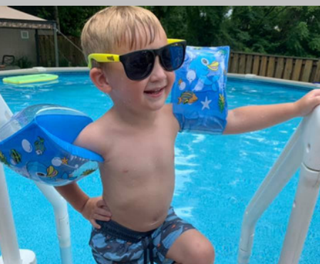
Contest Winner: Week 1

Interested? Head to our website for more information. Ready to get started with your new Money Market Account? Call, click, or stop by today!