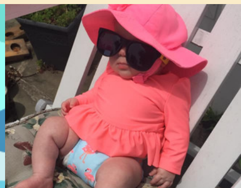
Contest Winner: Week 2